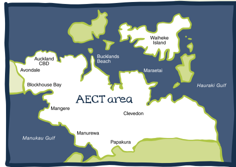
The AECT covers the area once served by the Auckland Electric Power Board – see aect.co.nz for more details.

You've been paid a $320 dividend because on 12 August 2007 you had a power account in the AECT area and your power bill includes a Vector lines charge. This makes you a beneficiary of the Auckland Energy Consumer Trust. So when the trust makes money, you get a share of it.